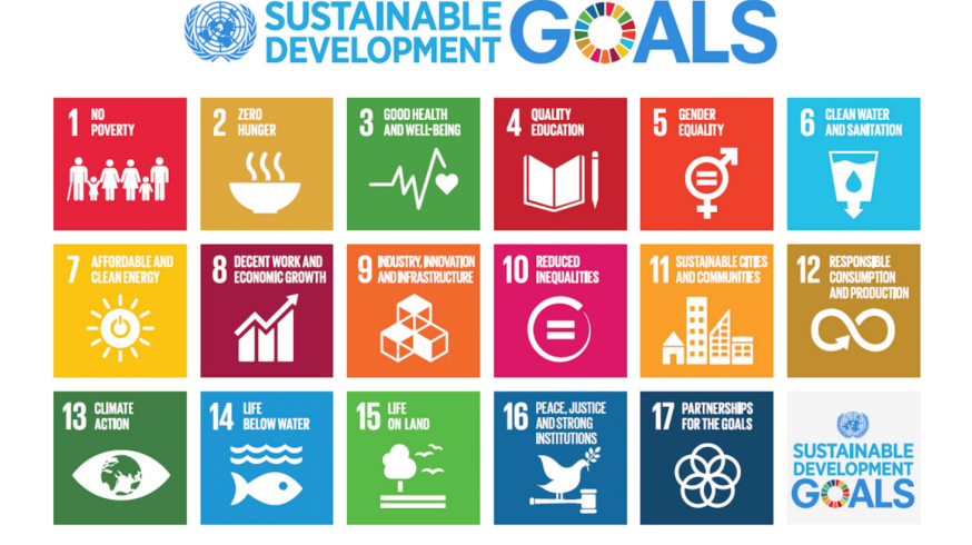
Figure 2. Sustainable development goals [45].

Of key importance for the consolidation of the concept of sustainable and balanced development was the agenda adopted in 2015 at the UN World Conference in New York, "Transforming our world: the 2030 Agenda for Sustainable Development" (Figure 2). By adopting the "Agenda 2030" document, more than 190 countries committed to pursue 17 sustainable development goals in their policies, broken down into 169 specific tasks. The goals adopted in "Agenda 2030" can be grouped into five areas marked by the following concepts, the 5P: people, planet, prosperity, peace, partnership. These goals cover a wide range of challenges related to poverty, hunger, health, education, gender equality, climate change, peace, and social justice. They replaced the previously adopted Millennium Development Goals, which were to be met by 2015 [44].